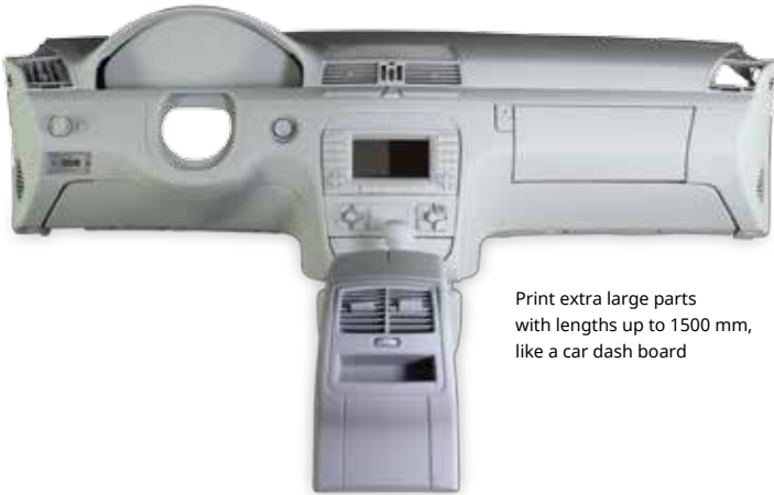
Print extra large parts with lengths up to 1500 mm, like a car dash board

3D Systems, the inventor of Stereolithography (SLA), brings you legendary precision in 3D printers, fine-tuned for cost-efficiency and unrivaled material availability. These advanced 3D printers produce exact plastic parts without the restrictions of CNC or injection molding. In addition to prototypes and end-use parts, these SLA printers create casting patterns, rapid tooling and fixtures. With speed, accuracy and surface quality of this level, you can produce low- to medium-run parts at a lower per-unit cost and build massive, highly-detailed pieces faster.