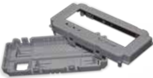
Electronic housing prototype printed in Accura Xtreme